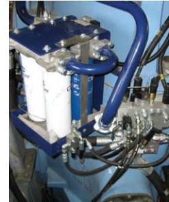
LUBE SYSTEM 'CONFIGURATION B' (RIGID PIPE FROM FILTER MANIFOLD)