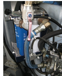
LUBE SYSTEM 'CONFIGURATION A' (FLEX HOSE FROM FILTER MANIFOLD)